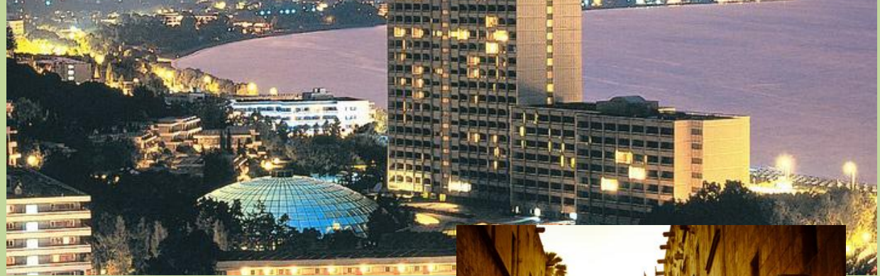
Conference Venue: Rodos Palace Hotel