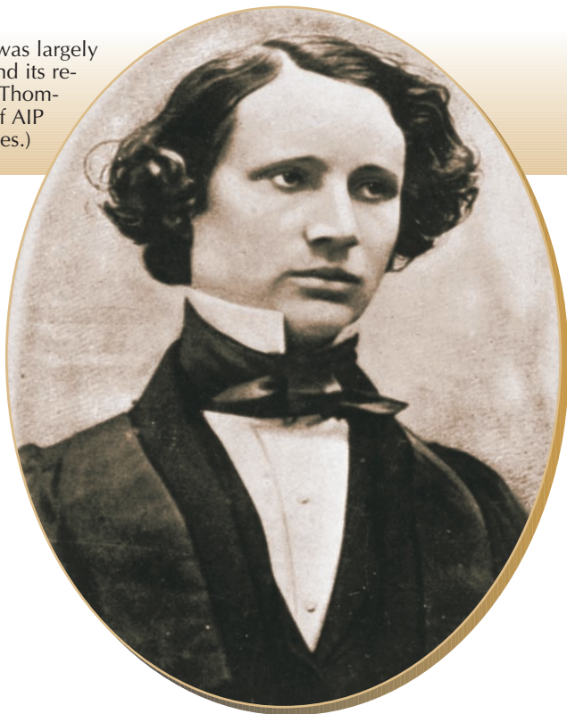
Figure 4. William Thomson, later Lord Kelvin (1824–1907) was largely responsible for the rediscovery of George Green’s 1828 essay and its republication (1850–54) in Crelle’s Journal. This photograph of Thomson was taken in 1846.